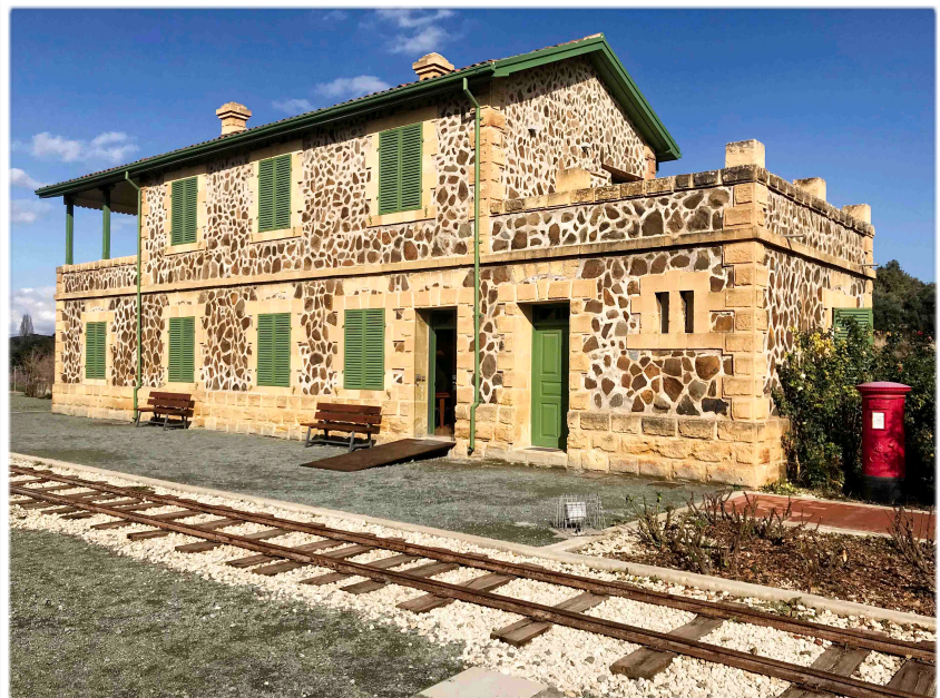
Evrychou Station and Cyprus Railway Museum

The High Commissioner's journey was 57 kilometres and two years later a further 38 kilometres had been added to the line taking it on from Lefkosia to Morfou. The line was further extended by 23 kilometres from Morfou to Evrychou in June 1915. The link to Evrychou completed the line.