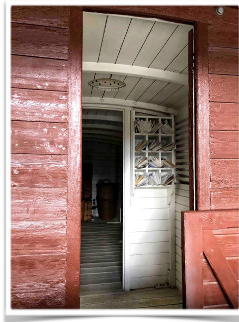
Mail Car with sorting facility

The KVHA does not necessarily endorse the views expressed in this publication.